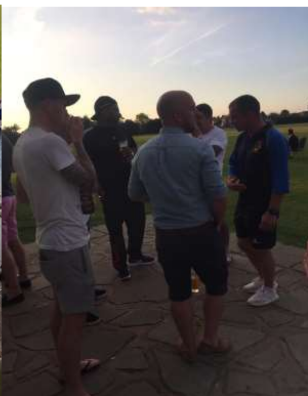
Rainham's seniors enjoy a beer and a bet at the recent race night.