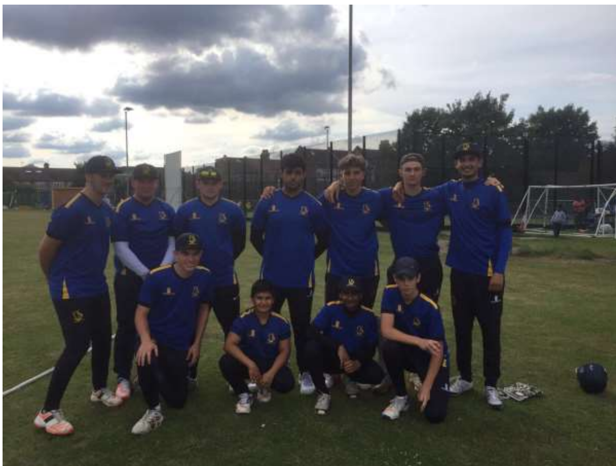
The boys in blue pre-victory photo. Some clearly more happy than others...