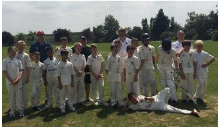
The under 11s with Gidea Park after their close 4 run defeat

Under 11s played in the Ardleigh Green Big Bash ball tournament. Lost both matches by 27 runs and 34 runs. Pictured with Essex County Championship Trophy.