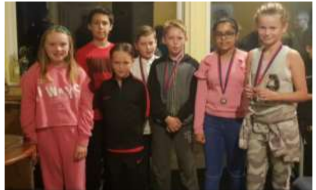
The under 11s with their medals from the mini matchplay festival at Essex CCC