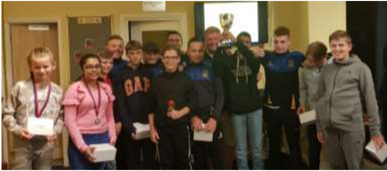
The under 13s with their medals and Havering League Cup