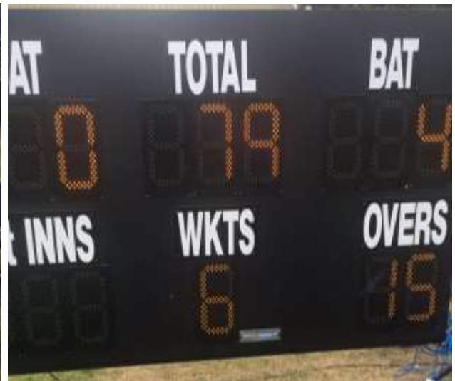
The storm has arrived.