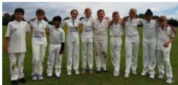
The under 11s celebrate their win against Wanstead