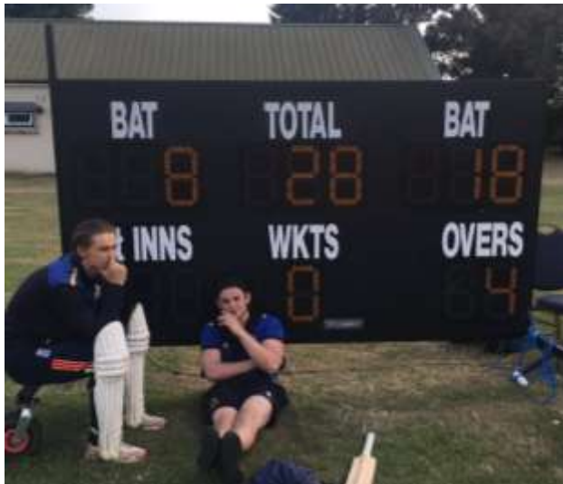
The calm before the storm.