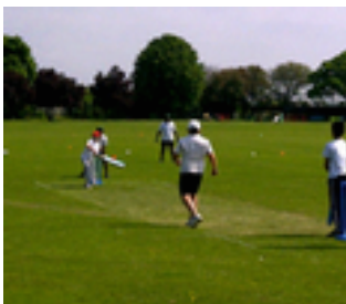
Action from the Newtons v Pyrgo group match

One of the highlights of the day was Brearley's umpiring in the final at square leg where Newtons needed 20 runs of the last over and one of the Newtons players pulled a short ball straight at Brearley's tender regions hitting a bulls eye with his bottle of Lucozade flying up in the air and Brearley left prone on the floor with one of the Newtons teachers showing great concern that he had prevented a four being scored!