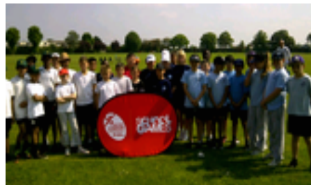
Participants from Newtons, Pyrgo, Broadford and Brady get ready for Kwik cricket action