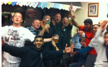
The 2 nd XI celebrate after promotion against Wickham