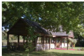
Mangapp Manor's picturesque outdoor wedding venue