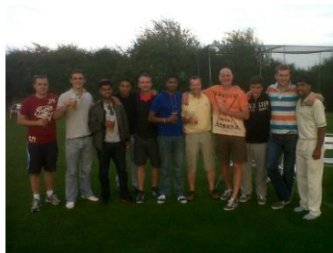
The 1 st XI with a more sedate celebration at Rayleigh