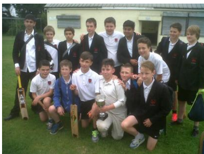
The Chafford squad proudly display the trophy for the 4 th consecutive year